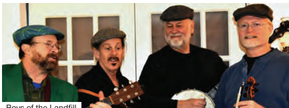
Boys of the Landfill