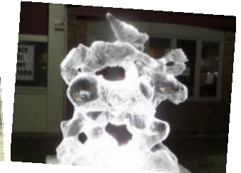
Greenfield Winter Carnival, 1923 & 2015