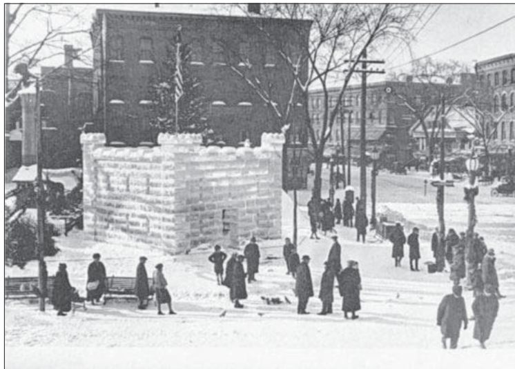
GREENFIELD HISTORICAL SOCIETY

A longstanding tradition, the carnival dates back to the winter of 1922, according to the Recreation Department.