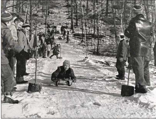
Left: Sledding at a midcentury Greenfield Winter Carnival.