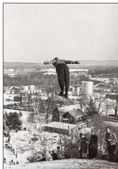
GREENFIELD HISTORICAL SOCIETY