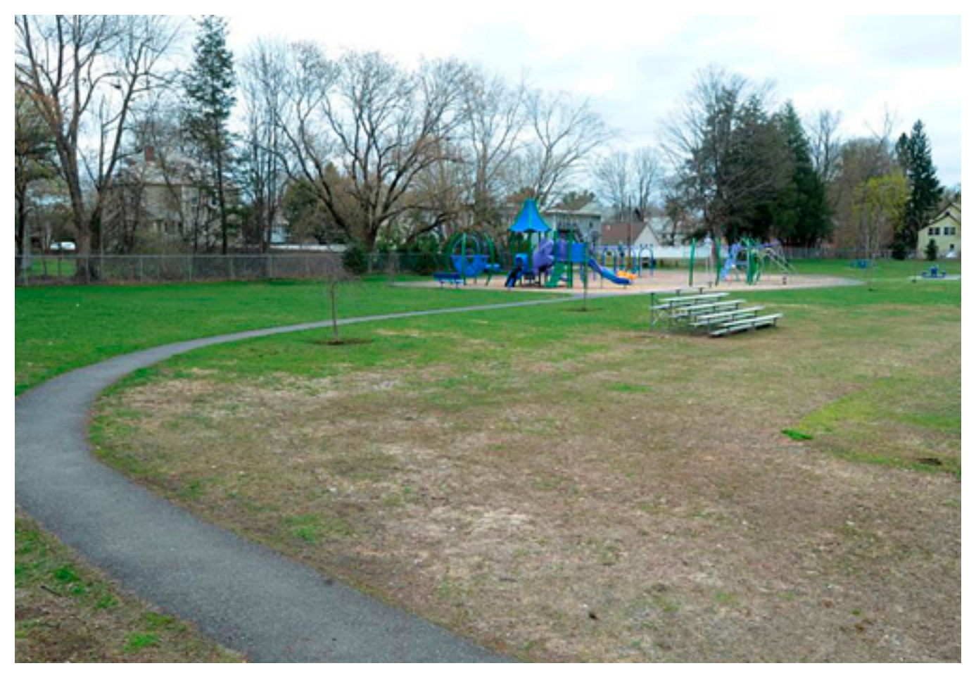
Hillside Park off Conway Street in Greenfield is slated to receive a water park feature.