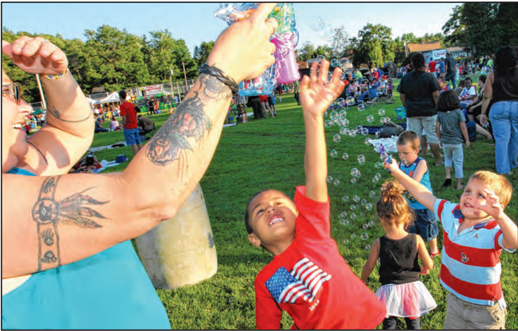
A group of kids enjoy bubbles on Beacon Field in the afternoon hours leading up to Saturday night's fireworks display.