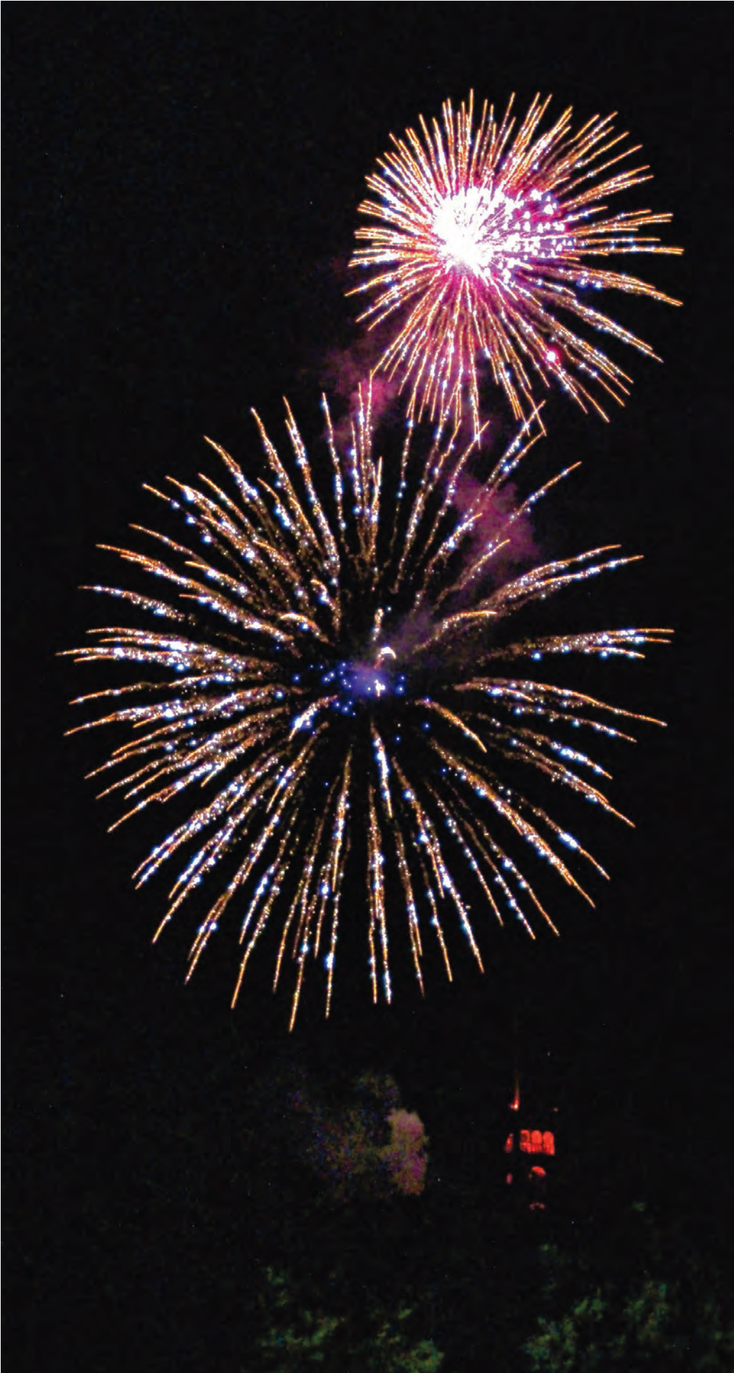
Fireworks go off over Poet's Seat Tower in Greenfield on Saturday as part of the Independence Day celebration.