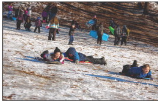
Children sled down the hill at Beacon Field during Greenfield's Winter Carnival Sunday.