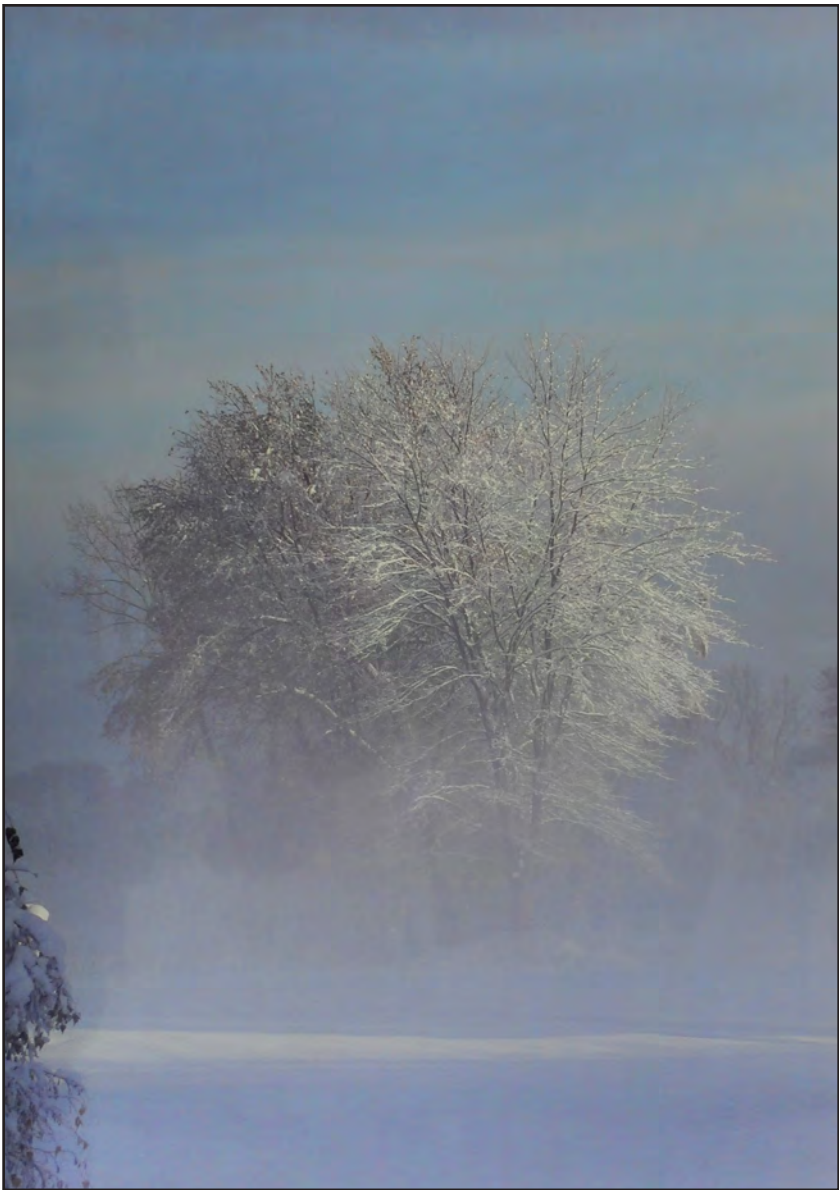
Third place, color, Glenn Woods of South Deerfield.

Note: You will find honorable mention winners on Page D3