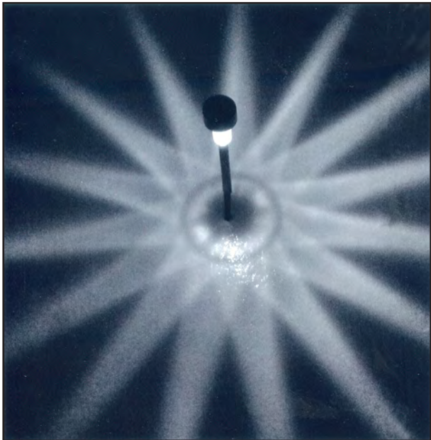
Second place, black and white, Myck LeMay of Greenfield. The composition of this photo, and of LeMay's third-place photo at right, really stood out.